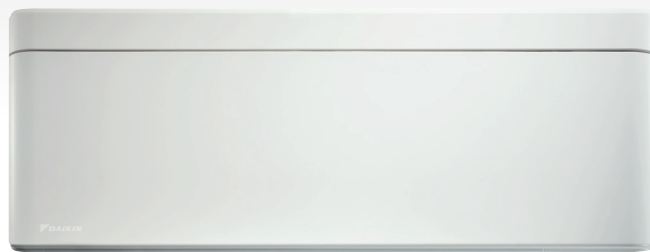
WHITE HAIRLINE FINISH